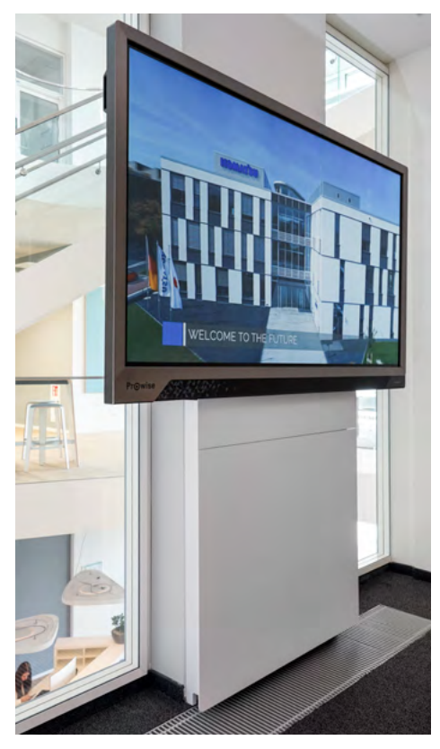
wall-mounted Display column_W7 L, with 75" display