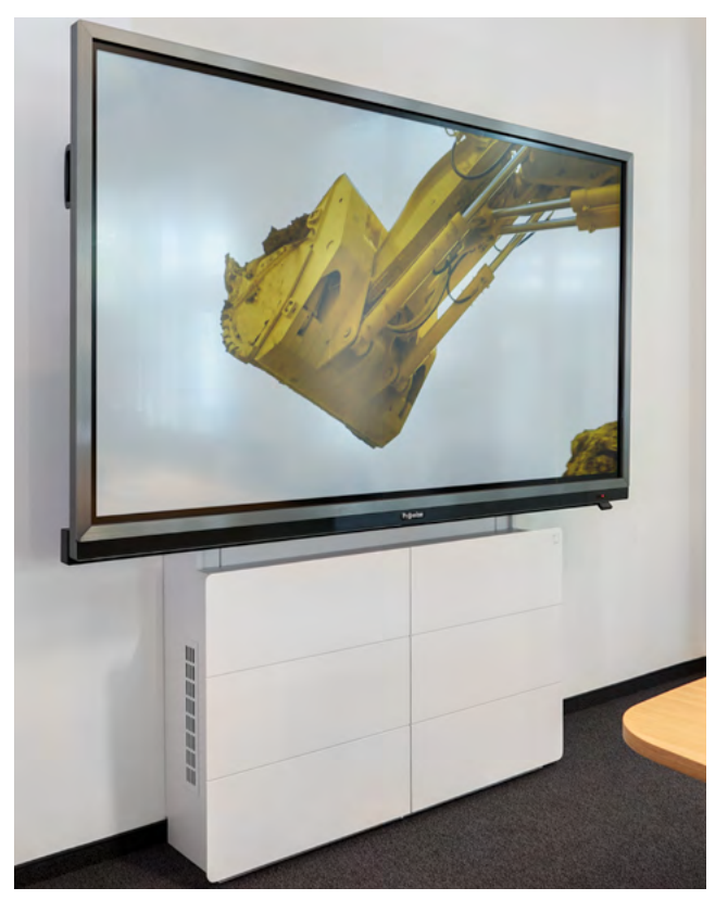
Height-adjustable Media furniture_S1 XL, wall-mounted, with 84" touch-screen display