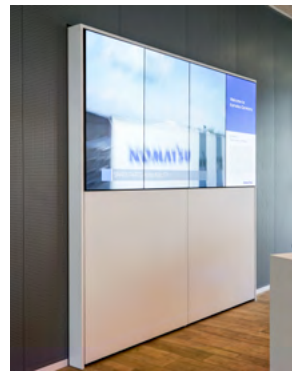
Slim Video wall with 4 x 55" displays, perfectly integrated into the highly representative lobby.

From a video wall in the lobby and different-sized conference and meeting rooms to a special telepresence room. The technological design and the project management was carried out by CANCOM GmbH, Langenfeld. They chose Holzmedia as competent partner for the media furniture, in order to satisfy the customer's high expectations for obtaining a solution with representative appeal.