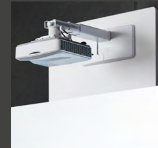
Horizontally adjustable mounting plate for beamers

Options: mounting plate for beamers · compartment / flap for power outlets · mount for VC camera, left or right side · doors with speaker covers · door locks