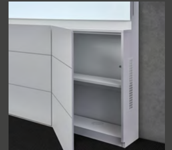
Compartment for technology integration for beamers