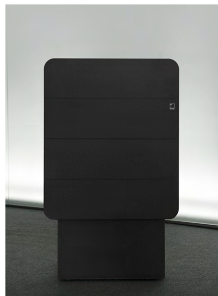
Varnished with structured lacquer. Colors: Arctic White, Lava Black, or customized, against surcharge.