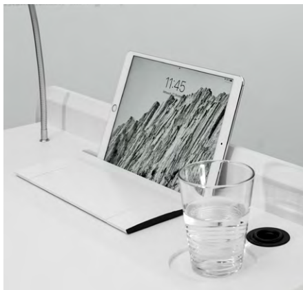
Cutout tablet holder as well as microphone / XLR socket.