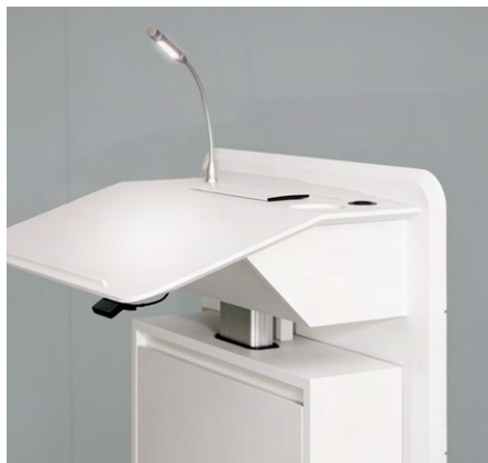
Slanted surface with paper stopper for manuscript or notebook.