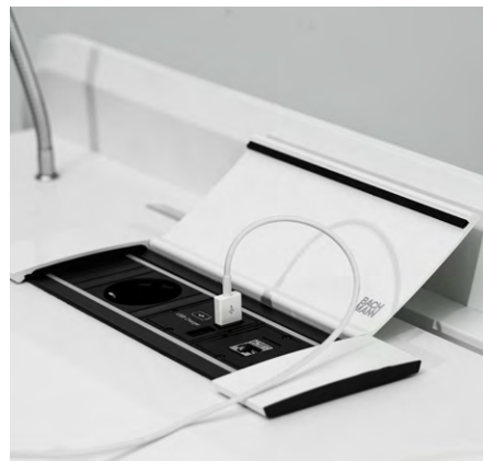
Connector panel "PowerFrame Cover" made up of 3 units (1 each: 230 V Schuko socket, double USB charger, RJ45 Cat 6- / HDMI-input).