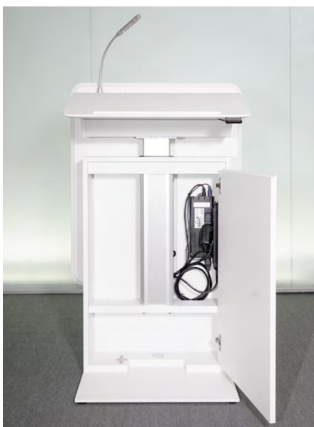
Body cabinet, 1-piece with hinged door and storage space, prepared for the integration of media technology, includes cable to floor outlet, includes 4-socket multi outlet inside the technology cabinet.